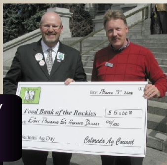
Colorado Ag Day generously supports FBR once again.

Ameristar Casino Cakes By Karen Cardinal Health Chelsea Catering Corporation Chick Fil A / Southwest Plaza Chick-fil-A / Thornton Chick Fil A / Federal Heights Chipotle Unit 0002 Chipotle Unit 0032 Chipotle Unit 0255 Ready Ice Colorado Convention Center EAS Embassy Suites Downtown Empire Warehouse Honey Baked Hams Hyatt Regency / DTC Grand Hyatt Denver Jeppesen Jump Start Cafe King Soopers Donation Department King Soopers 05 King Soopers 10 King Soopers 100 King Soopers 128 King Soopers 16 King Soopers 17 King Soopers 21 King Soopers 26 King Soopers 30 King Soopers 35 King Soopers 39 King Soopers 49 King Soopers 52 King Soopers 69 King Soopers 72 King Soopers 83 King Soopers 93 Litehouse Littleton Hospital Marten Transport Merchandise Mart Metro Care Ring National Jewish Center Navajo Shippers Company Occasions By Sandy Olive Garden - Northfield Pizza Hut- 706326 Pizza Hut - 706302 Pizza Hut - 706010 Pizza Hut -706120 Pizza Hut -706309 Pizza Hut -706036 Rite Of Passage Rocky Mountain Popcorn Co. Rosacci Fine Catering Safeway Distribution Center Sams Club #6631 Aurora Sams Club #6630 Arvada Sams Club #6634 Lone Tree Sams Club #4816 Southland Sams Club #4777 Stapleton Sam's Club #4816 Southland Sanctuary Golf Course Sheraton 4 Points Sigma-Alimentos Sodexho -Comcast Sodexho - Digital Lighthouse Sodexho DU/Ritchie Center Super Target Arvada Super Target Aurora Super Target Brighton Super Target Denver West Super Target Glendale Super Target T2030 Super Target NE Westminster