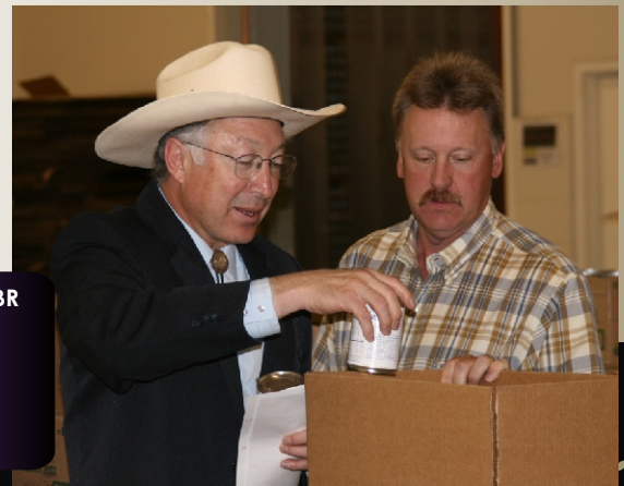
Senator Ken Salazar visits FBR to share how the successful passage of the farm bill will help fight hunger.