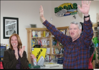
KOSI Celebrates Their Win